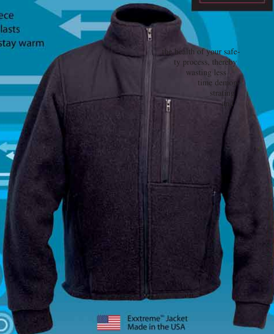
Exxtreme™ Jacket Made in the USA